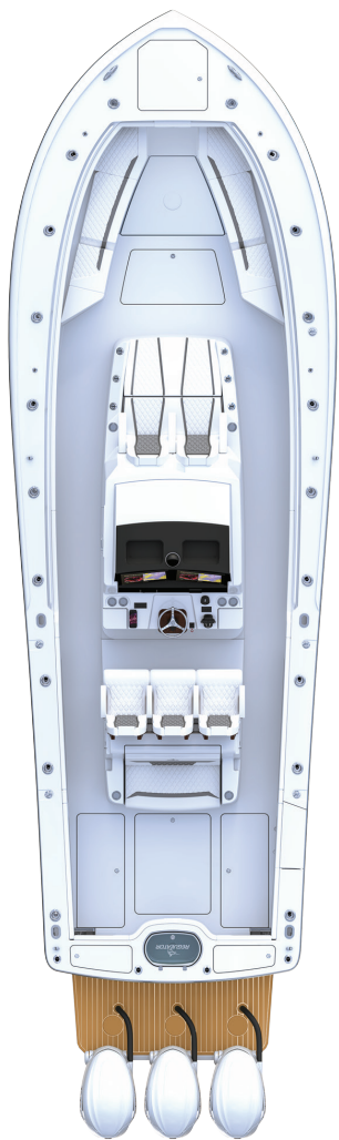
Rendering may show both Standards and Options