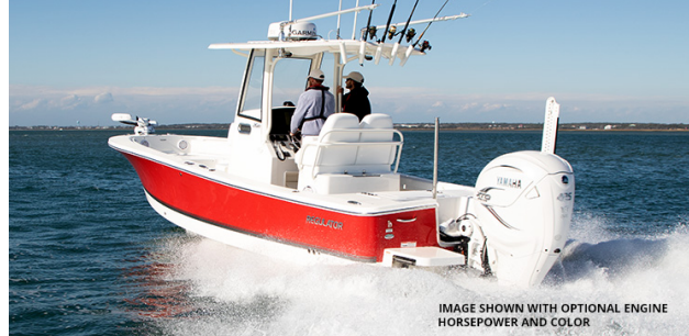
IMAGE SHOWN WITH OPTIONAL ENGINE HORSEPOWER AND COLOR

YPB#: PB_REG_26 XO_XF450XSA_09-01-2023_OCC